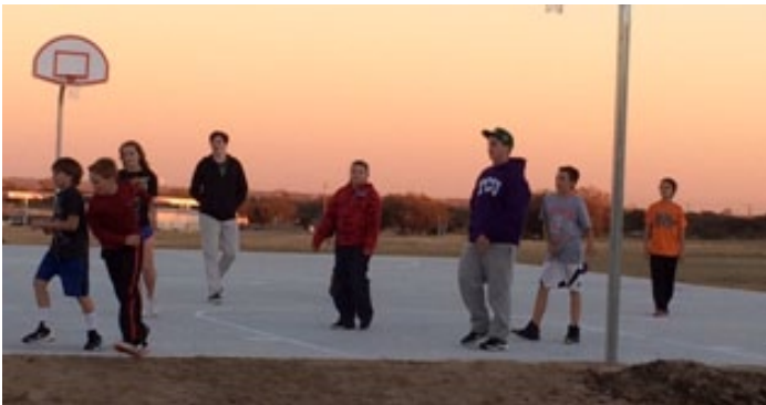
The basketball court in Reatta Ridge was a sponsored project by the CDC. The Reatta Ridge HOA contributed $5,000 to the project, as well.