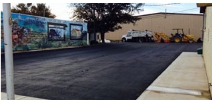
The new parking lot next to the ED building is sponsored by both the EDC, CDC and Parks Department. The parking lot has made a huge difference to the downtown area! Concrete work has been started at the Old Fields for new backstops and dugouts!