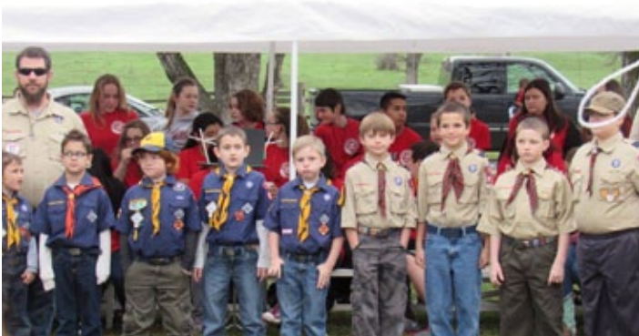
Local Cub Scout Pack 931 led the Posting of Colors and Pledge of Allegiance.